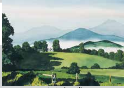
Mist in the Hills Available as a notecard & print