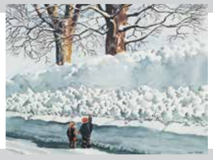
After the Snowfall Available as a notecard & print