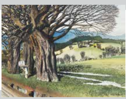
Vermont Backroads in April Available as a print