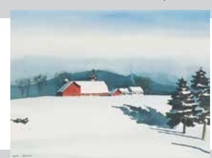
Snowy Morning in Elmore Available as a notecard & print