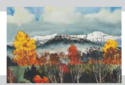
First Snow on Mt. Mansfield Available as a notecard & print