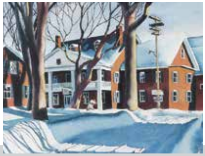
Green Mountain Inn in Winter Available as a notecard & print