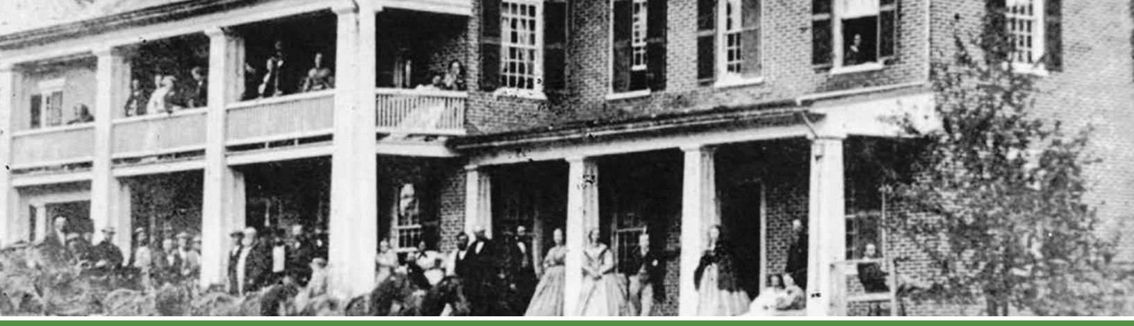
History of the Green Mountain Inn (continued)