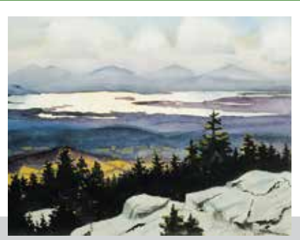
View of Lake Champlain from Mount Mansfield Available as a notecard & print