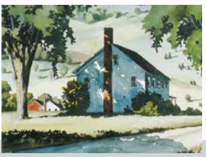
Farm House on a Country Road Available as a notecard