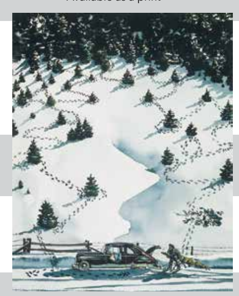
The Christmas Tree Available as a print