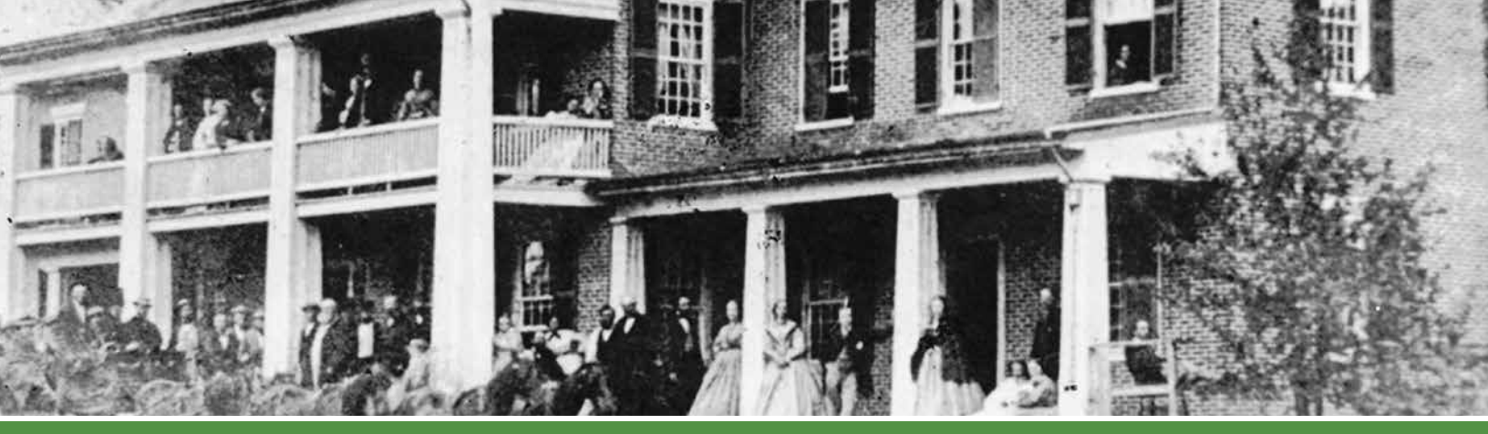
History of the Green Mountain Inn (continued)

the Depot Building was expanded to enlarge the retail space in the Depot Shops and to offer four additional deluxe rooms with many of the same amenities as the Mill House. In 1999, the Inn purchased and completely renovated the historic Sanborn House on Depot Street, adding two luxurious Village "apartments" – one with one bedroom and the other with two. The Sterling and Pinnacle feature fully equipped kitchens, living rooms with fireplaces, large screen televisions and DVD Players, washers and dryers and master bedrooms with fireside Jacuzzis.