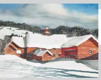
Stowe Hollow Barn Available as a print