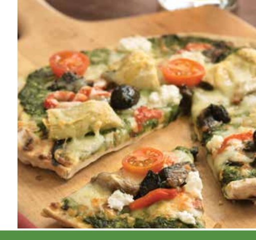
Dining at the Inn