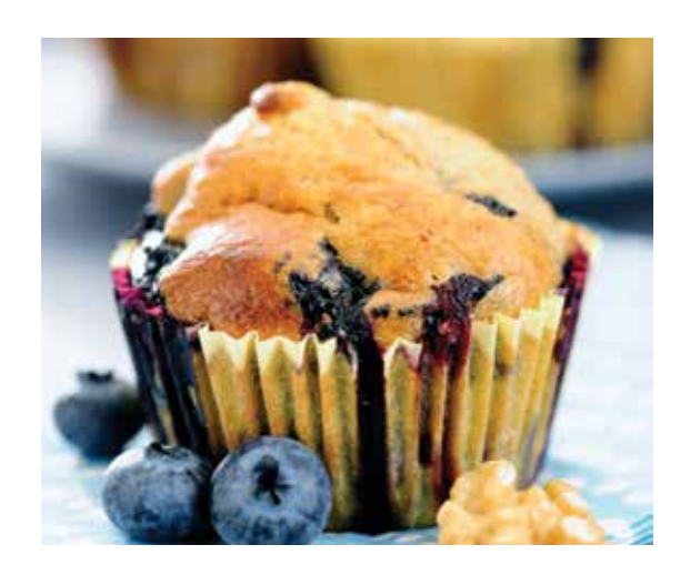
Breakfast at 18 Main Breakfast is available to guests at 18 Main, located in the Main Inn daily 7:00 - 11:00am. Takeout is available, please order online at www.thewhip.com or call extension 677